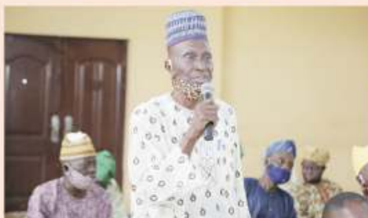
Chairmen of Community Development Councils (CDCs) from LGAs of probable flood risk at the engagement.