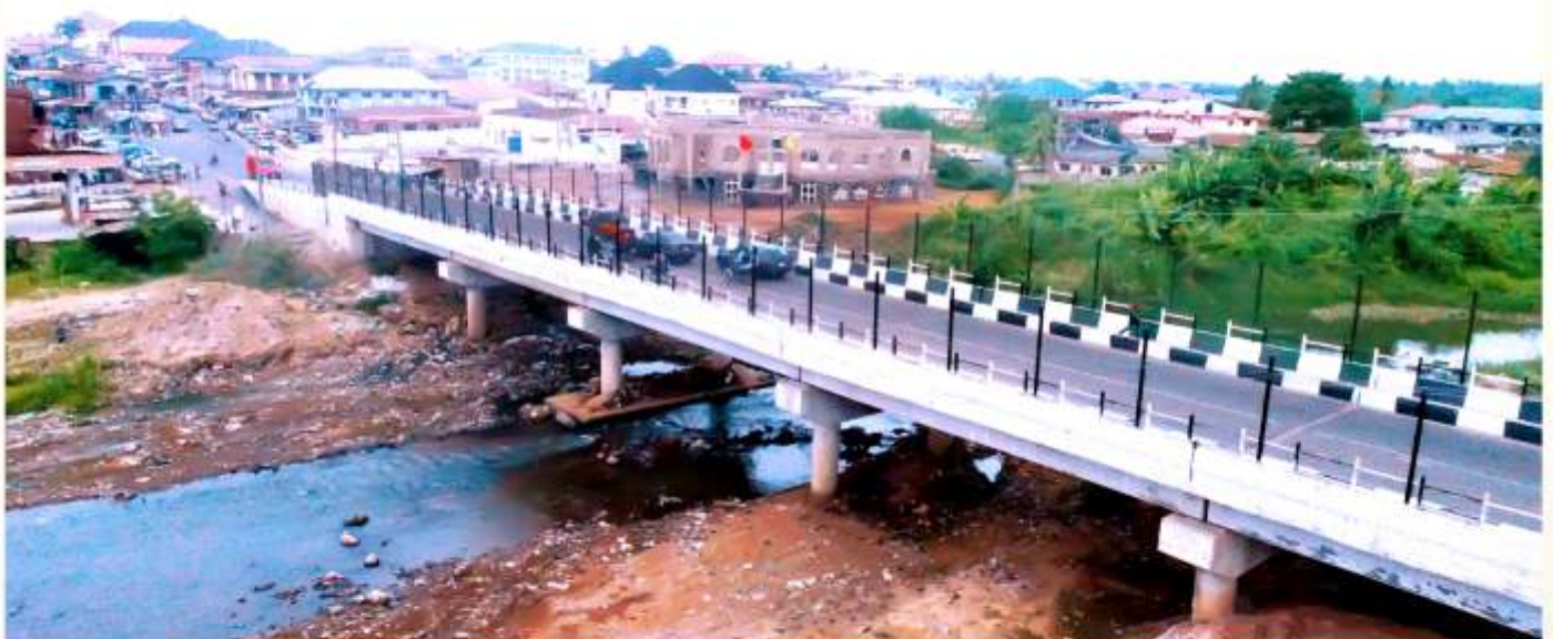
The expansive Believer's Stream Bridge already serving the people of Odo Ona Elewe and other users

The 13 Priority Sites are composed of the hydraulic structures of varying sizes at Abonde-Ogbere, Alaro 7-Up, Alaro Poly, Believer's Stream, Ebenezer, Elere, Fworogi, Isokun-Ojoo, Maje, Ogbere-Moradeyo, Oki Oke-Ayo, Olorungunwa, and Omirin. These sites transverse the length and breadth of Ibadan