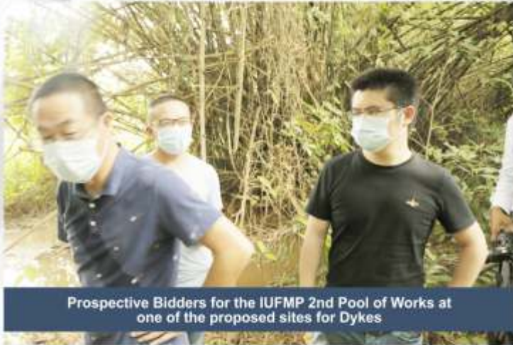
Prospective Bidders for the IUFMP 2nd Pool of Works at one of the proposed sites for Dykes