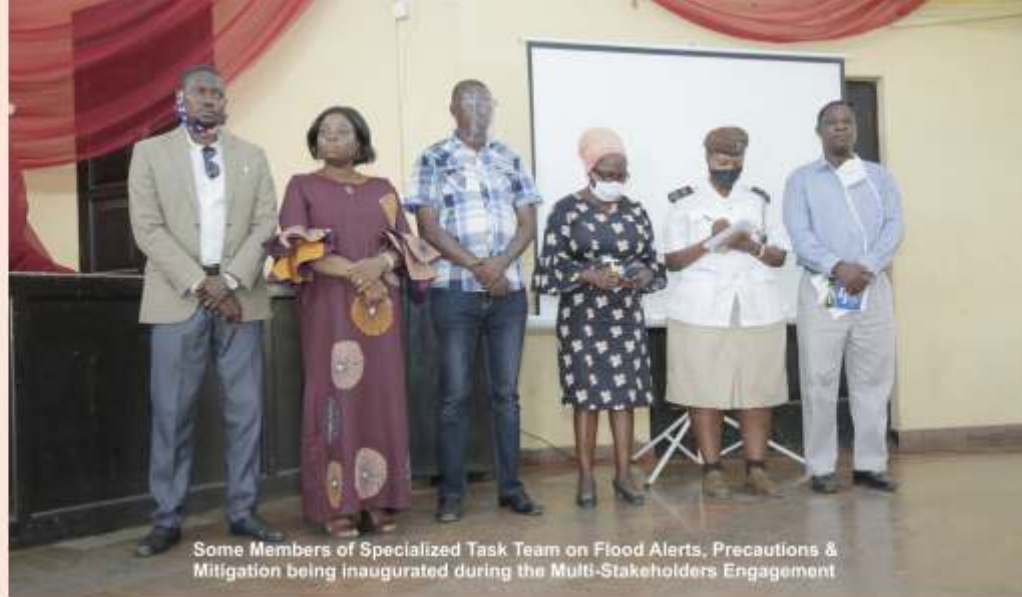
Some Members of Specialized Task Team on Flood Alerts, Precautions & Mitigation being inaugurated during the Multi-Stakeholders Engagement

The Stakeholders' Meeting was wrapped up with the inauguration of an inter-Ministerial Specialized Task Team charged with the responsibility of visiting the identified LGAs/LCDAs of probable flood risk, identifying spots requiring urgent/quick-fix attention, working in concert with LGAs and other community-based organizations to proffer immediate solutions, and recommending further necessary interventions (if any) to the State Government. Representatives were drawn from Ministries of Environment & Natural Resources; Local Government & Chieftaincy Matters; Lands, Housing & Urban Development; and Information, Culture & Tourism. Other MDAs represented were Oyo State Emergency Management Agency (OYSEMA); Oyo State