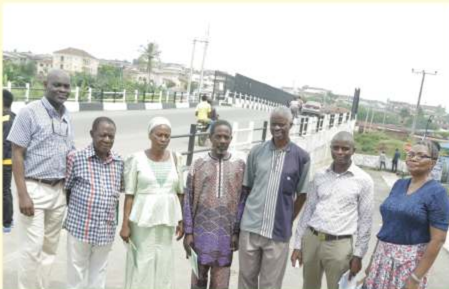
Community Leaders of Believer's Stream Area with some PIU members

This area had experienced several flood hazards before this bridge was constructed, which caused us to record many deaths and loss of valuables. And many of our houses [buildings] were affected both left and right [upstream and downstream]. Many businesses and sources of livelihoods were also adversely affected by the perennial flooding. The bridge that has just been constructed for us in this area is the "best of the best", because what we had before was way too low, and was easily overtopped by flooding. So we have had relief from flooding. And we (community leaders) were involved through several stakeholder engagement sessions and training programmes at different phases of the intervention. We in this community have every