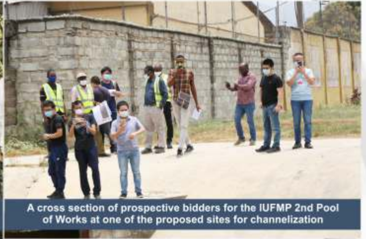
A cross section of prospective bidders for the IUFMP 2nd Pool of Works at one of the proposed sites for channelization