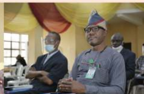
Caretaker Chairmen of LGAs and LCDAs of predicted probable flood risk at the Multi-Stakeholders Engagement on Flood Alerts & Precautionary Measures.