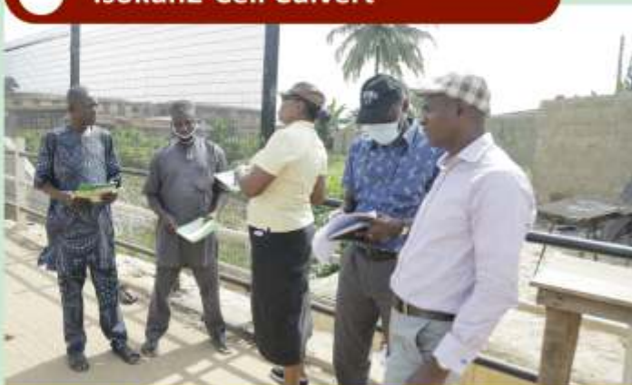
Some leaders of Isokun-Ojojo Area being engaged by PIV members on the work done in their area.

B efore this intervention by the Oyo State Government, we had faced so much challenges in this area. All our past self-help, communal efforts and individual contributions to get the place fixed amounted to nothing! This place was hardly passable then. The culvert we had then was so small and low, resulting in rain runoff overtopping the culvert and cutting off commuters. In fact, the stream down there had once swept off a motorbike rider. But since the Government through IUFMP took up this project and has now completed it, it has brought us so much relief and comfort. No matter the volume of rainwater now, it no longer overtops the culvert, nor do our houses get flooded.