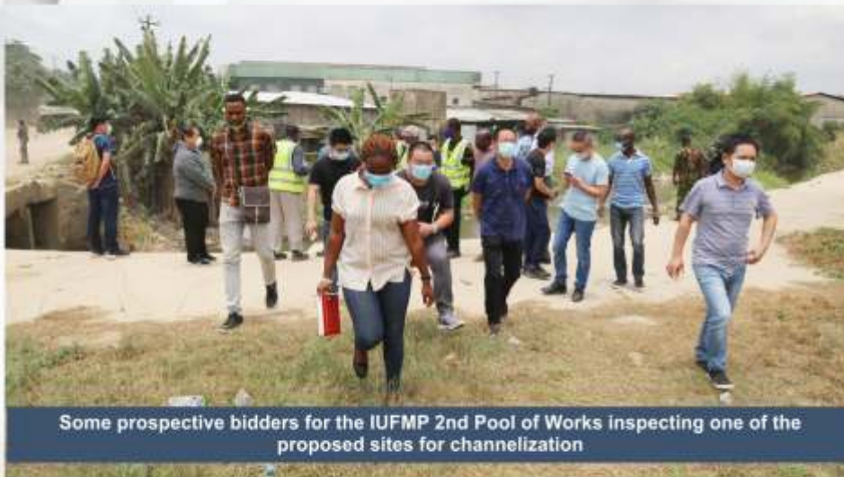
Some prospective bidders for the IUFMP 2nd Pool of Works inspecting one of the proposed sites for channelization