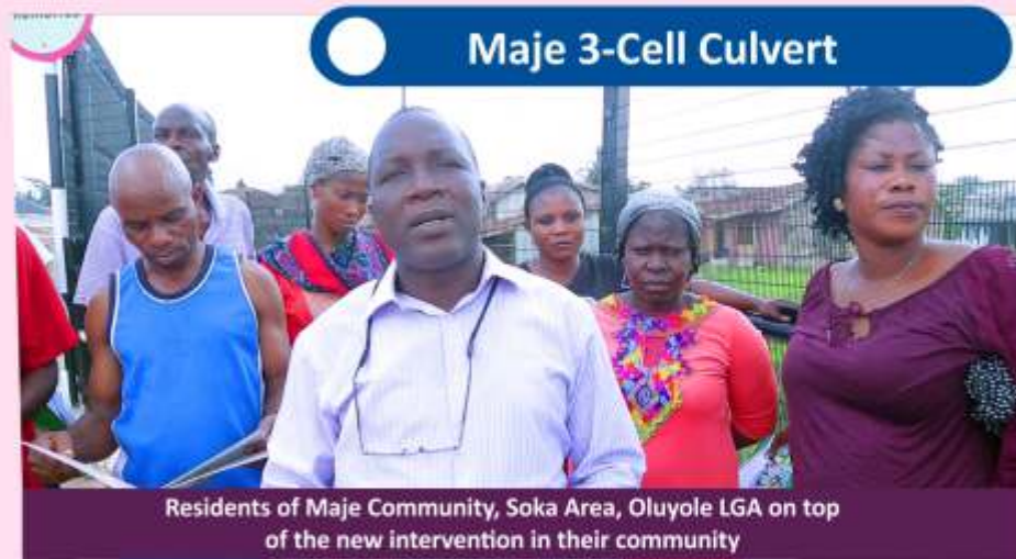
Residents of Maje Community, Soka Area, Oluyole LGA on top of the new intervention in their community

B efore the construction of this culvert, we faced a lot of problems in this area, like loss of many lives. Whenever it rained, many who worked or were doing business outside this area had to stay back. I can say that we lost between 8 and 10 persons to flooding here. It was a small and very low culvert we had here, which got easily flooded and overtopped. But we thank the Oyo State Government for remembering us. The quality of the job done here is excellent! It is a perfectly good job. And we were well carried along in the process of executing the job. We attended quite a number of workshops, during which they educated us on the work processes, communal leadership, etc. As a community, we are committed to maintaining the works, like