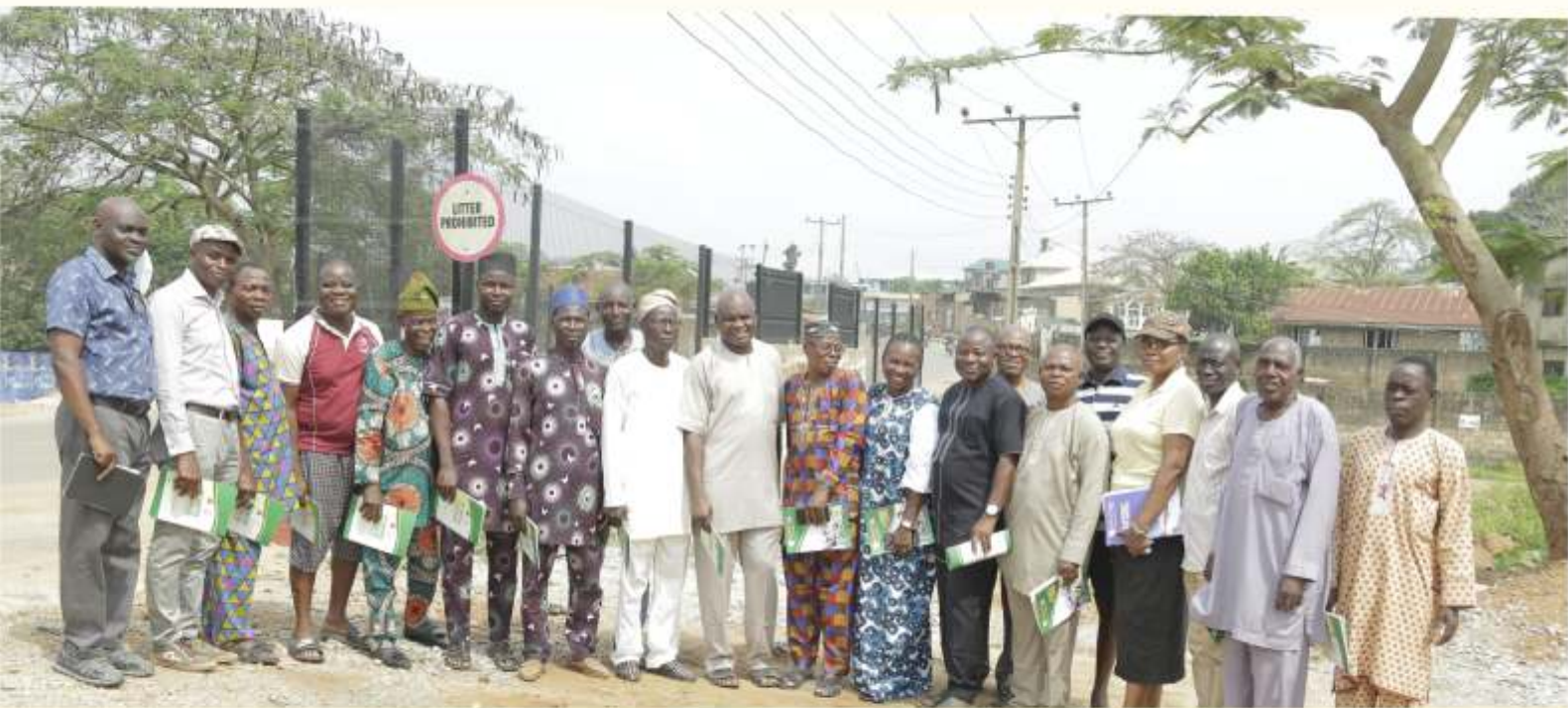
Community Leaders of Omirin and Olorungunwa Communities, Adekola Area, Egbeda LGA in a group photograph with some representatives of the IUFMP PIU

Be that as it may, since development projects take place in a human context, it is expedient to sound out the direct and indirect beneficiaries