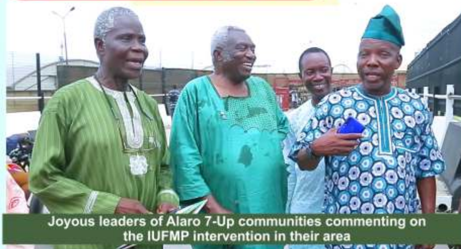
Joyous leaders of Alaro 7-Up communities commenting on the IUFMP intervention in their area

B efore the advent of this bridge and the road network, the fear of flood was the beginning of wisdom for us in this place, because anytime it rained, we felt like not coming home. Because the whole place would have been flooded. Once we saw the heavens (cloud) gathering up, the fear of coming back home would grip us...and even when you managed to return home, the roads were so terrible. The scope of this bridge is okay, the job is well done, neat, good, and we are happy that we have it.