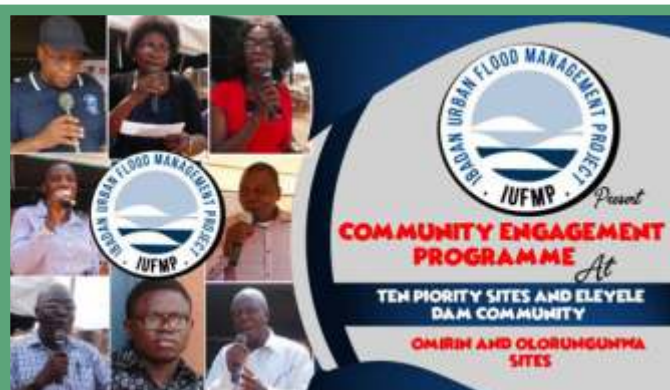
Ominrin And Olorungunwa Sites