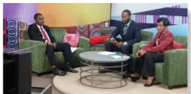
PC on AM 120 on BCOS