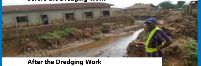
After the Dredging Work