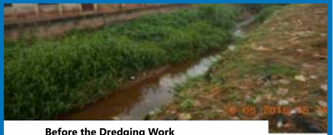
Before the Dredging Work