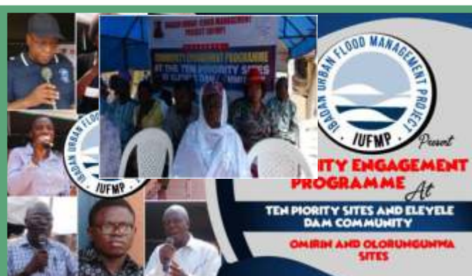
Community Engagement meeting at Ogbere Moradeyo