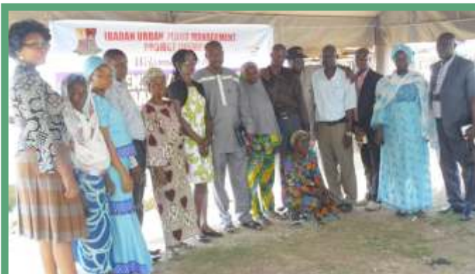
IUFMP Team and Women Leaders at Ogbere Pegba