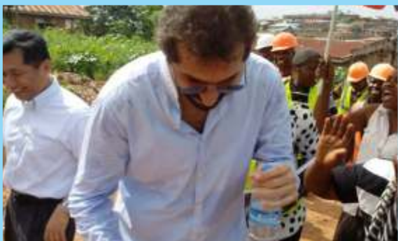
Community appreciating the team