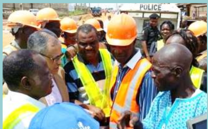
At Ogbere Pegba, WB Country Director engaging a community member