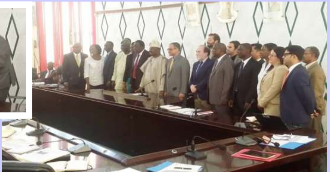
WB Country Director's visit to His Excellency, the Governor of Oyo State.