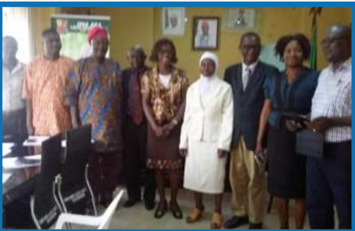
Visit to Ona Ara Local Govt