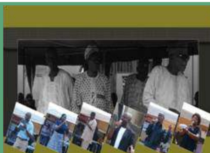
Community Engagement meeting at Ominrin and Olorungunwa