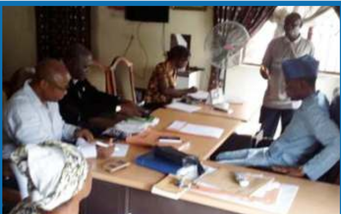
Visit to Egbeda Local Govt