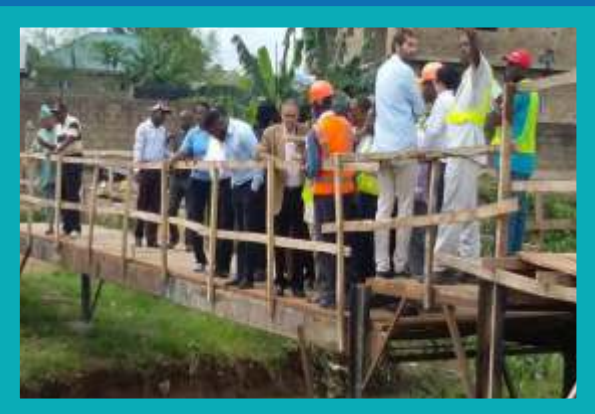
At Cele Rainbow