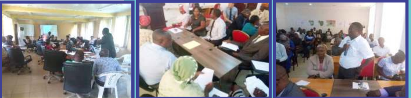
Visioning workshop with sub-technical committee