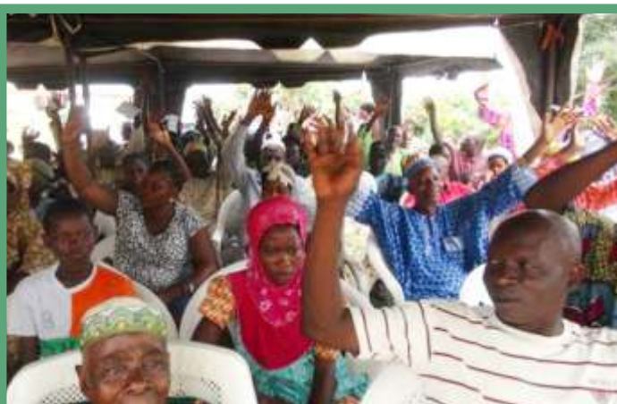
Sasa Osajin and Ola Adua communities