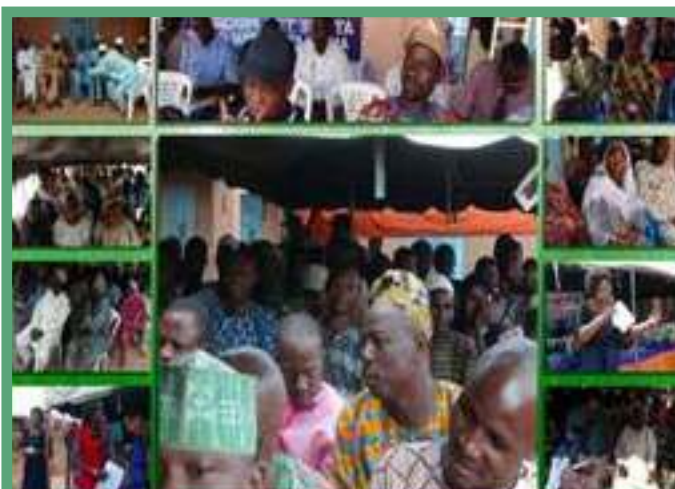
Community Engagement meeting at Elere and Foworogi