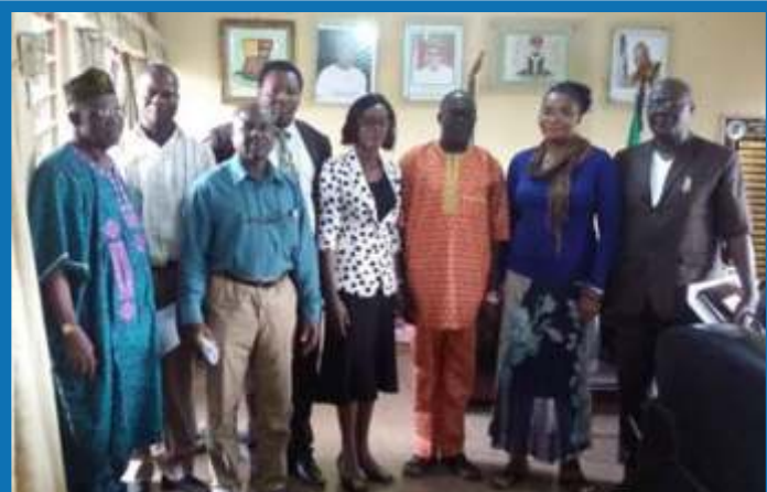
Visit to Akinyele Local Govt

As part of efforts to collaborate with the Local Government Areas where the Project sites are situated, the IUFMP Social Team paid courtesy visits to the Caretaker Chairmen of Akinyele, Egbeda and Ona Ara Local Government Areas.