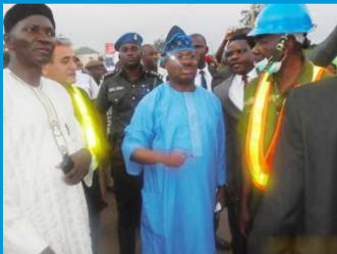
GOVERNOR'S INSPECTION OF DREDGED SITES