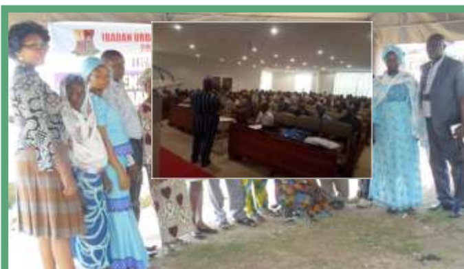
Stakeholder Consultative Forum at Ibadan Business School