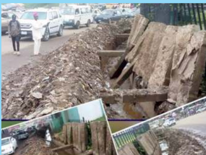
CLEARED DRAINS AT IWO ROAD INTERCHANGE