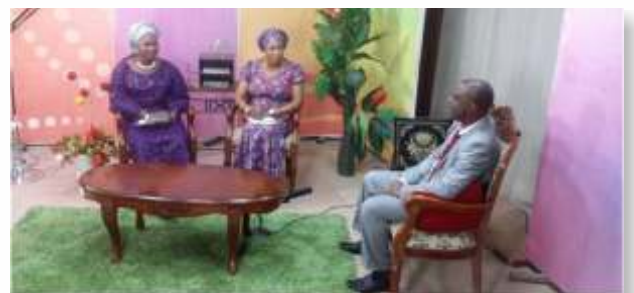
Project Coordinator on Eyi Ara Programme at BCOS

The Nigeria Hydrological Services Agency (NIHSA) issued a flood alert that there was likely to be flooding in the city of Ibadan. To this end, the Oyo State Government through the Ibadan Urban Flood Management Project (IUFMP) embarked on series of activities to mitigate the impact of flooding if and when it occurs. Part of the activities embarked upon was sensitizing the citizens on the dangers inherent in dumping refuse in drainages and water channels; as these are some of the causes of flooding in Ibadan. The IUFMP in collaboration with the Ministry of Environment and Water Resources also commenced dredging of rivers and streams as these would assist in water capturing of the rivers thereby allowing for free flow of water.