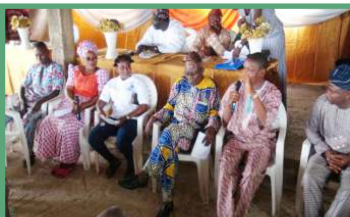
Cele Rainbow: Mobilization through Drama Presentation by the Social Team