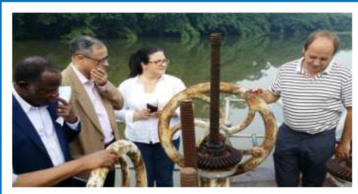
At Eleyele Dam